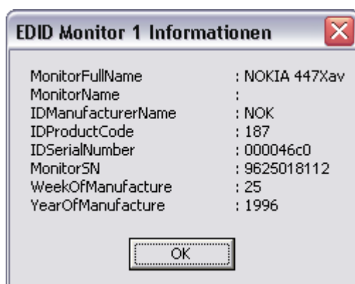
Illustration: Export to a windows-dialog